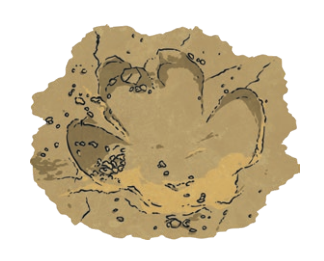
It was made with a stuffed hippo foot.

In 1935, a hunter said he found a footprint on the banks of Loch Ness.